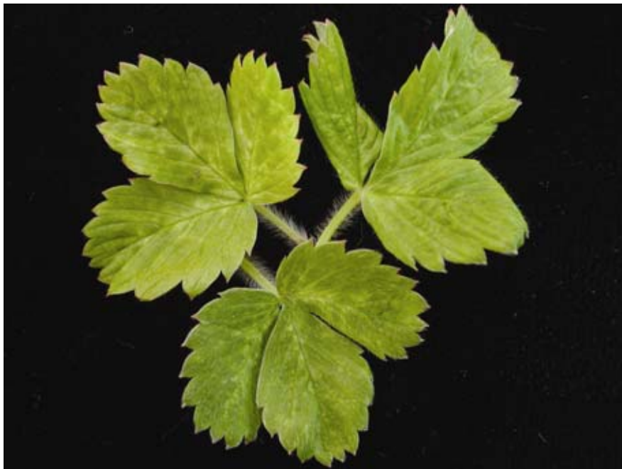
Fig. 4. Fragaria vesca exhibiting peacock pattern symptoms and downward curling of leaves. The leaves shown are from a plant infected with Apple mosaic , Beet pseudo yellows , and Strawberry pallidosis associated viruses.

Strawberry latent C virus (SLCV). Strawberry latent C (SLC) is a poorly described disease, first reported in 1942 (28). Electron microscopy studies on infected material have identified a nucleorhabdovirus associated with the disease (111), which was designated as Strawberry latent C virus (SLCV). The disease has been reported from eastern North America, and studies have verified that the causal agent can be transmitted by grafting and several aphid species (8). A wide range of symptoms has been attributed to SLCV, although it is difficult to rule out the possibility that some isolates may be due to mixed infections with other viruses. The importance of the virus is mainly due to synergism with other strawberry viruses. Grafting and aphid transmission to indicator plants are the only available methods today to detect SLC disease. Sensitive F. vesca clones such as 'EMC' and 'UC-5' develop symptoms that include epinasty and dwarfing; however, verification of