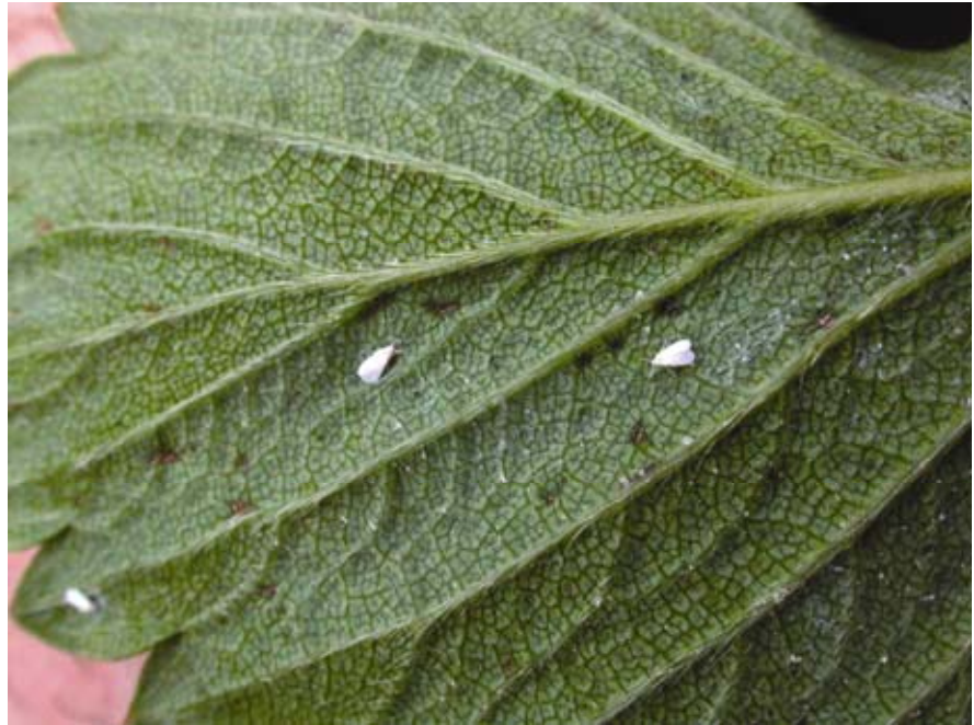
Fig. 6. Strawberry near Watsonville, CA, with greenhouse whiteflies on the under surface of a leaf. Whiteflies have only recently become important pests of strawberry in California.

Strawberries are vegetatively propagated, and in most cases, the increase from nuclear stock to certified plants that are sold for fruit production takes place in the field, where there is potential for reintroduction of viruses. In the past, efforts during plant production have concentrated on controlling nematode and aphid vectors. The nematodes have been controlled efficiently with methyl bromide and other soil fumigants, and aphids through the use of insecticides, although development of resistance to the chemical insecticides has been a problem. With the discovery of whitefly-transmitted viruses that infect strawberry, attention must now be directed toward the control of whiteflies. The greenhouse whitefly has a very broad host range and recently has become naturalized in the strawberry growing areas of California and the southern United States (107). During the 2002 and 2003 growing seasons, incidences of plant infections with SPaV and BPYV infection reached as high as 90% in southern California strawberry fields, and over 70% in the Watsonville area along the central coast of California. In mixed infections with several of the aphid-borne viruses, whitefly-transmitted viruses caused a serious decline (92) (Fig. 1). In field visits in 2003, it was noted that whiteflies were present on most strawberry leaflets (Fig. 6), and this is consistent with