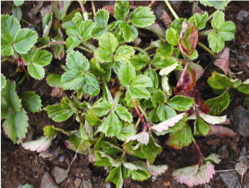
Fig. 5. Fragaria chiloensis near Contulmo, Chile, naturally infected with Strawberry crinkle virus , Strawberry mottle virus , Strawberry mild yellow edge virus , and Strawberry vein banding virus .

A large portion of the RNA polymerase of this novel virus, designated Fragaria chiloensis cryptic virus (FCICV), has been sequenced, and an RT-PCR detection test has been developed. In order to minimize the possibility that the dsRNA molecule is encoded by the plant genome, multiple DNA extractions from plants that tested positive for FCICV were carried out and tested by PCR without a reverse transcription step. In all cases, no amplicons were obtained in PCR, while the cryptic virus was readily detectable after RT-PCR using either total RNA or dsRNA preparations (100). A band of ~1.8 kbp was extracted from the dsRNA gels and was both cloned and subjected to RT-PCR. Both tests confirmed that this band belonged to this cryptic virus. More than 20 FCILV-free F. chiloensis plants were tested for FCICV, and several tested positive for the virus, indicating that FCILV is not needed for replication of this cryptic virus (100).