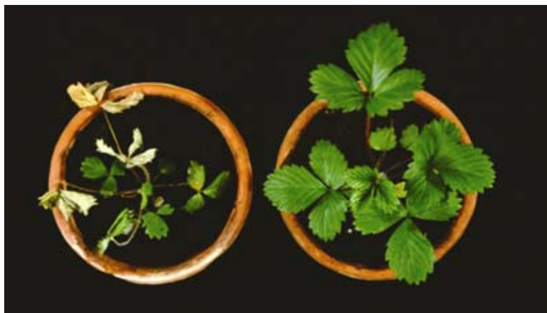
Fig. 3. Fragaria vesca inoculated with full-length clone of Strawberry mild yellow edge virus (SMYEV) (left) and uninoculated (right), demonstrating that the strawberry mild yellow edge potexvirus is capable of causing typical symptoms of the disease.

F. vesca and F. virginiana indicator clones all develop symptoms when infected with SVBV; 'UC-6' and 'UC-12' are the most sensitive of the two indicator species. The intensity of symptom development varies depending on the virus isolate and the indicator used. Three types of symptoms are known to be caused by different strains of SVBV: (i) vein banding, (ii) leaf curl, and (iii) necrosis. Vein banding symptoms, seen as chlorotic banding along the primary and secondary veins, are most intense in the first few leaves that develop after grafting. Leaves that develop later may show discontinuous streaks along the veins, mild chlorosis along the veins, or no symptoms. The vein banding symptoms tend to be more severe with