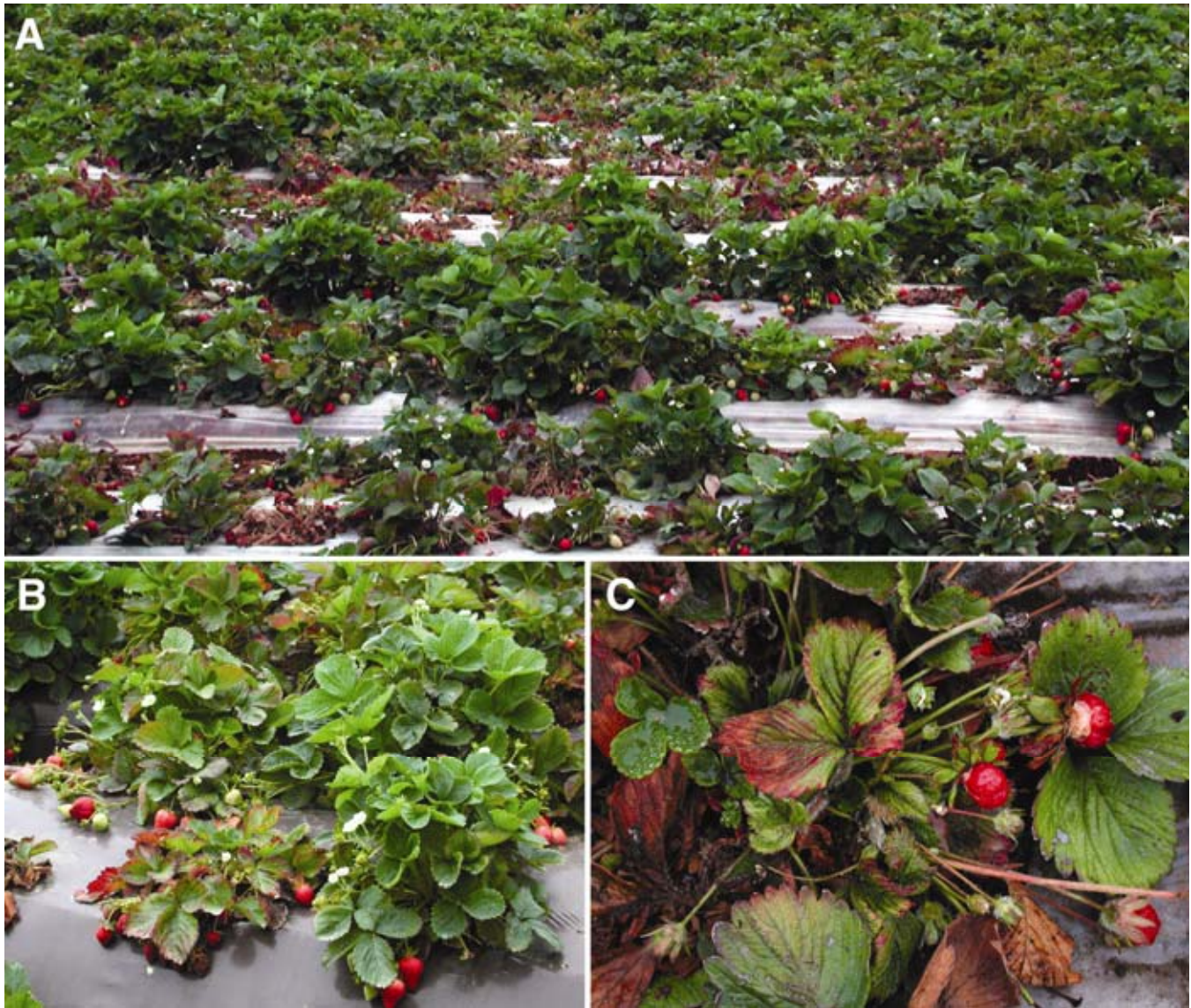
Fig. 1. Decline symptoms in strawberry plants near Watsonville, CA, U.S.A.: A, production field showing reddening, uneven growth, and decline associated with infection by multiple strawberry viruses in 'Ventana'; B, several plants of 'Ventana' at various stages of decline; C, close-up of 'Camarosa' strawberry plant that exhibits reddening, stunted and distorted leaves, and small fruit.